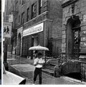
Living Rooms: O Urban Pioneers!