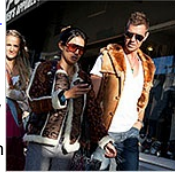
The Tribes of San Francisco

It is true many Iraq reconstruction projects failed, but the obstacles of rebuilding were many.