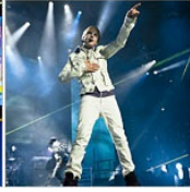
Send in the Heartthrob. Cue the Shrieks