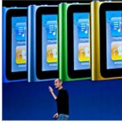
From Apple, a Step Into Social Media for Music