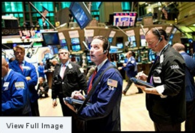
View Full Image