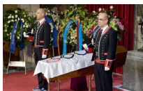
People bid farewell to Samaranch