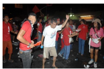
Bomb blasts hit Bangkok, at least 5 dead, 100 injured