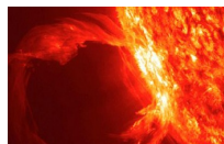
NASA releases new eruptive prominence images