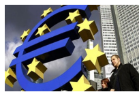
Eurozone public deficit up sharply in 2009