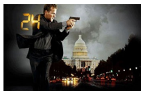
Kiefer Sutherland talks up "24" movie