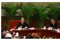
Chinese Premier Wen Jiabao urges development of renewable energy