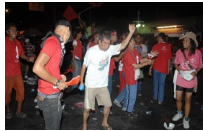
Bomb blasts hit Bangkok, at least 5 dead, 100 injured