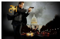
Kiefer Sutherland talks up "24" movie