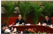
Chinese Premier Wen Jiabao urges development of renewable energy