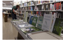
America's greenest public library in Park City